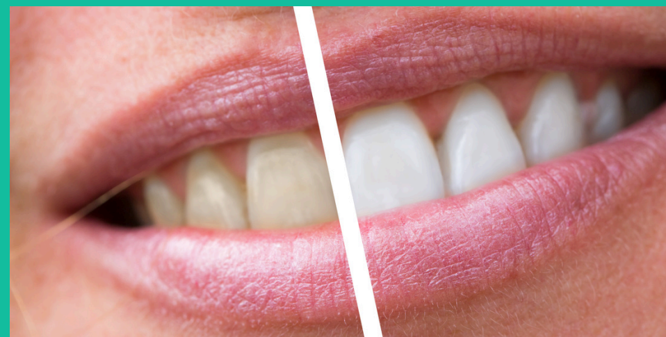
Teeth Whitening in Delhi