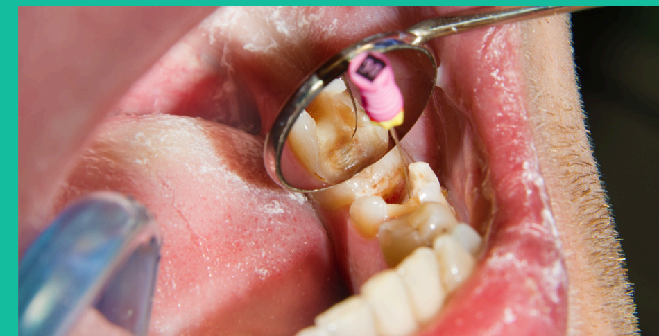
Painless Root Canal Treatment in Delhi